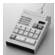
A631001: Remote Controller