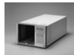
6332: Mainframe for 2 Load modules